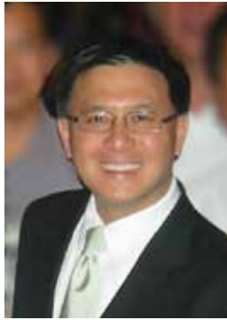
State Controller John Chiang

State Controller John Chiang has been a staunch supporter of state employees since his election six years ago. As the man who signs the state's checks, he consistently rejected demands by the previous Governor and others to withhold paychecks or reduce them to minimum wage when the Legislature was late with the state budget. He also refused to implement furlough salary reductions unless ordered to do so by the Legislature or the courts.