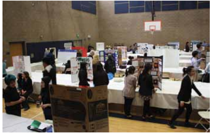
Over 300 science and engineering projects fill Rosemont High School's two gymnasiums.