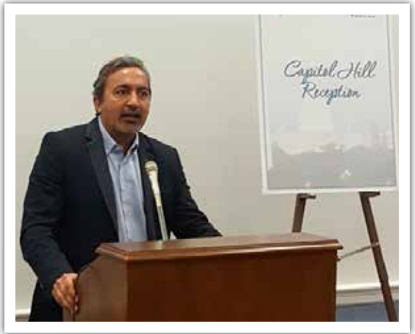
Congressman Ami Bera (D-CA) addresses attendees at the NASHTU Annual Conference Reception in Washington, D.C.