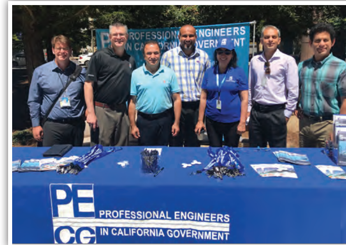
PECG Leaders prepare to recruit new members and reward them with PECG merchandise

Please keep up the good work and keep recruiting new members into PECG!