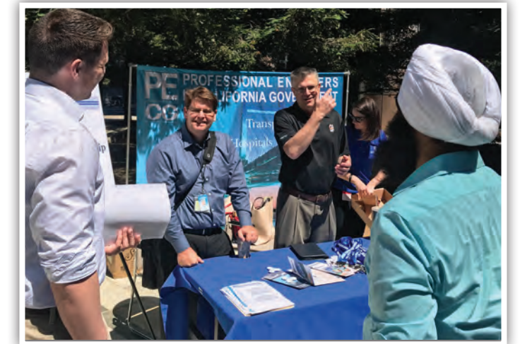
PECG Leaders answer questions and discuss the benefits of membership at the CalEPA building

PECG leaders plan to host similar events in the weeks to come. Stay tuned!