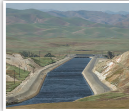
PECG-supported Prop. 68 dedicates $4 billion for water and related projects