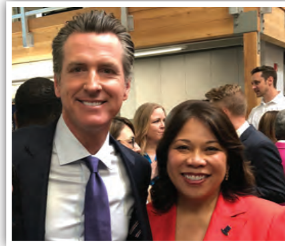
PECG President Elect Cathrina Barros with Gavin Newsom

PECG-endorsed candidates and ballot measures nearly swept the June 5 primary election. In 80 of the 81 statewide and legislative races in which PECG took a position, our candidate advanced to the November general election. The two PECG-supported ballot measures, Proposition 68 ($4 Billion in Water Bonds) and Proposition 69 (Prevents Diversion of Transportation Revenue), passed overwhelmingly.