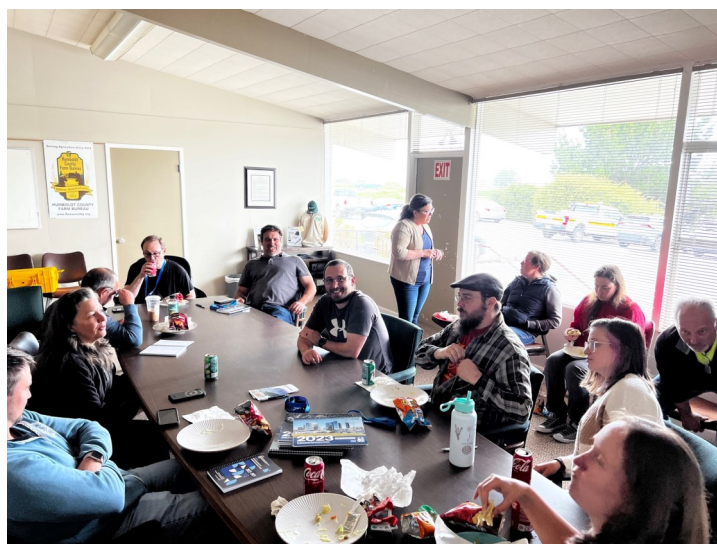
Right: Spruce Point Construction office employees gathering in the breakroom for lunch during a PECG Eureka Section offsite meeting (2023)