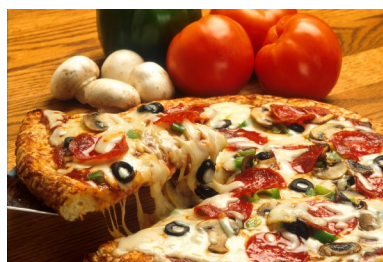
Right: Eureka Section members attending the in-person PECG meeting on 1/31/2024