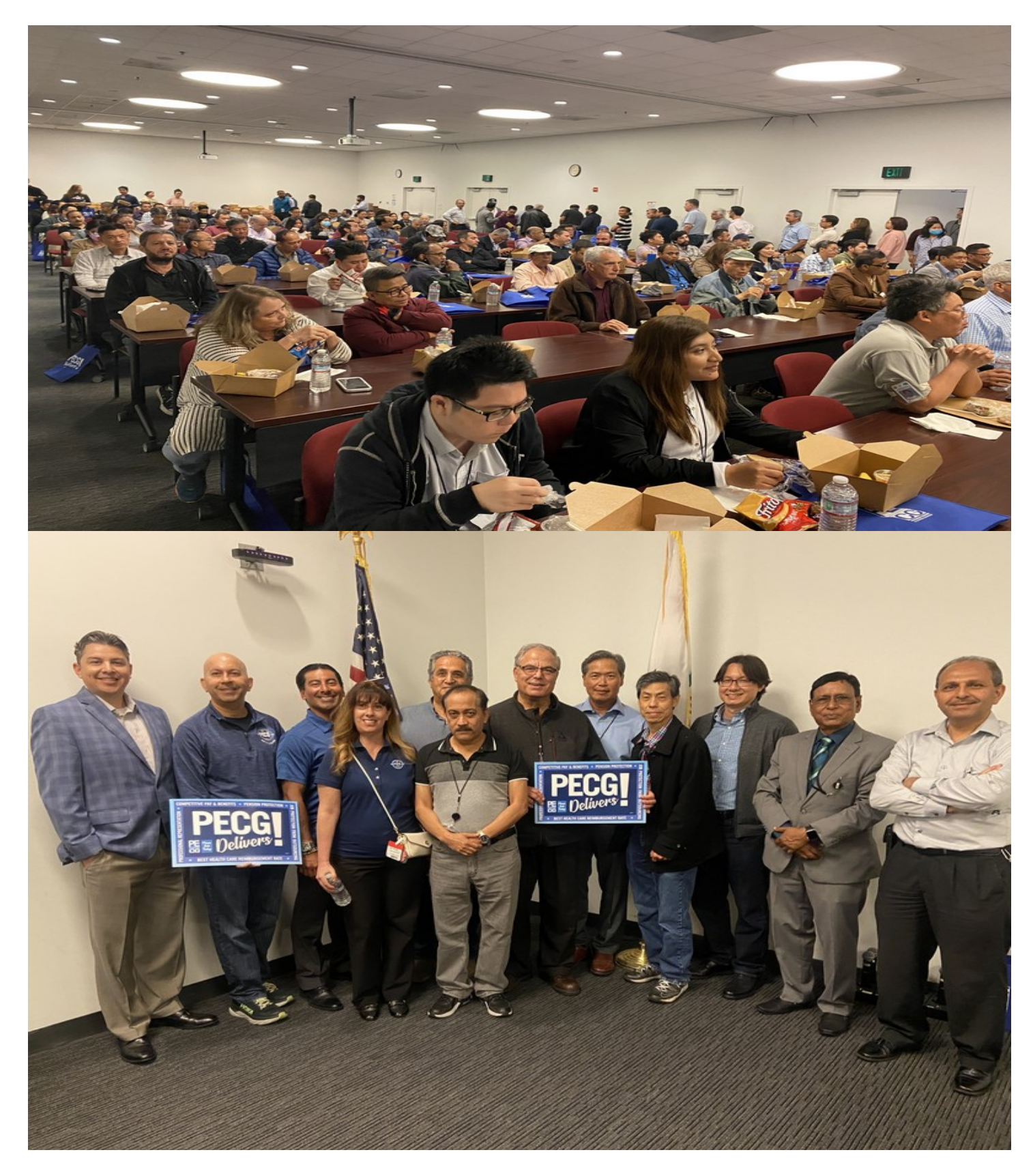
Membership Appreciation Day May 17th, 2023

The Member Appreciation Day was a hit, with over 300 attending and enjoying lunch graciously provided by our corporate leadership. There were plenty of questions and lots of camaraderie, since this was our