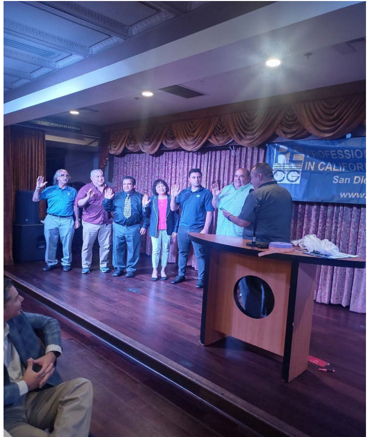
Swearing in the 2023-2024 SD PECG Section officers!