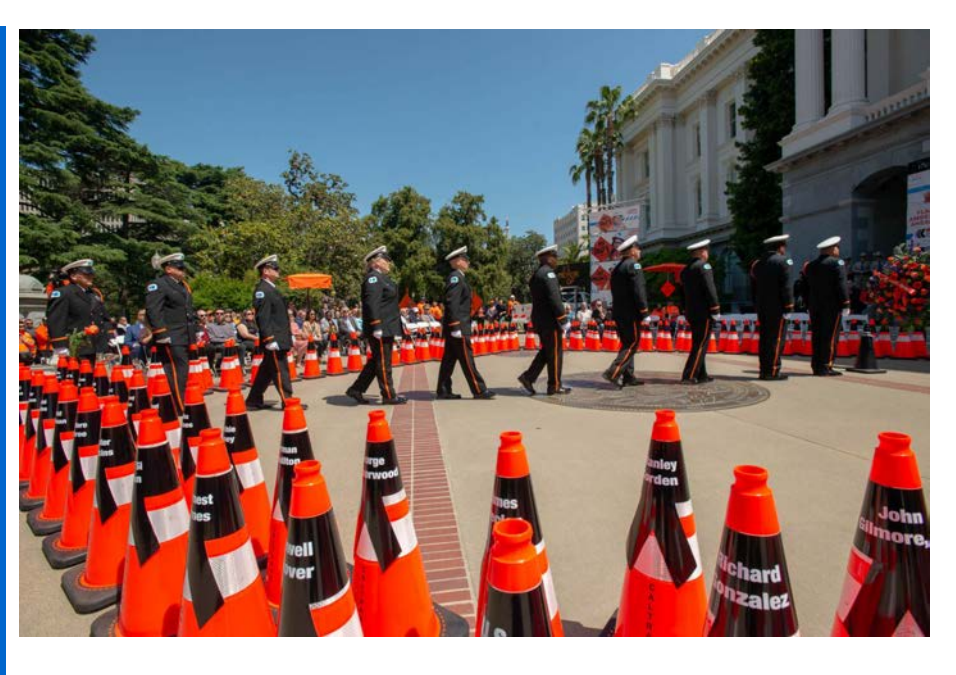
The Caltrans Honor Guard at the 2023 Workers Memorial

visit the PECG webpage for more information about the scholarship program and