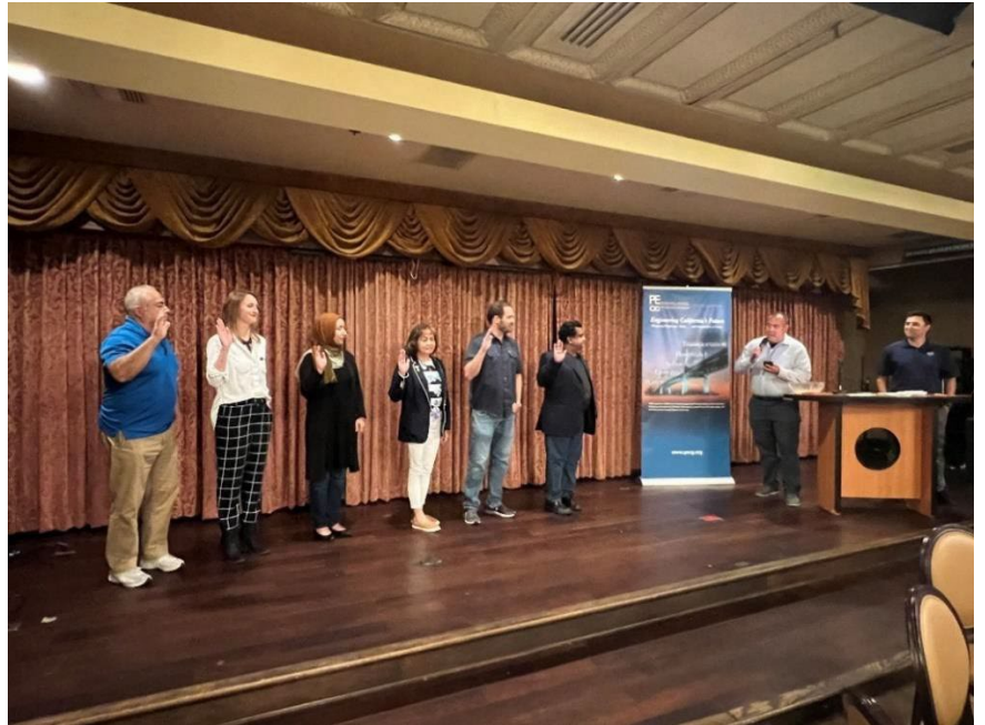
Swearing in the 2024-2025 SD PECG Section officers!

On Thursday, September 12, 2024, the San Diego PECG section hosted the Annual Dinner for all section members at Sufi Mediterranean Restaurant.