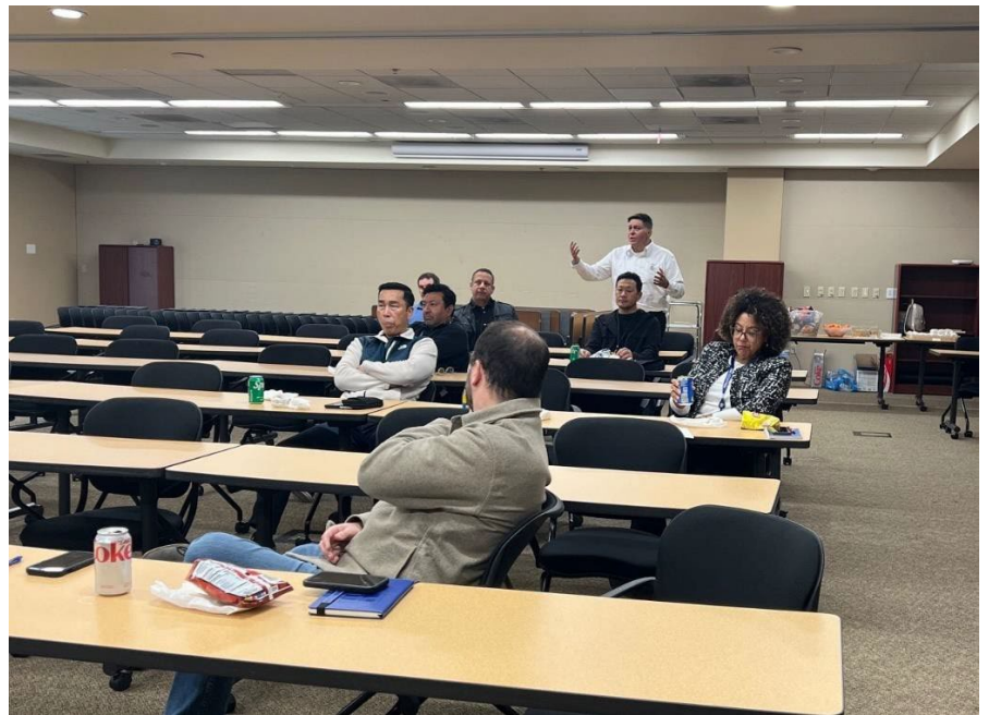
D11 supervisors gathered at Caltrans D11 and on Teams.