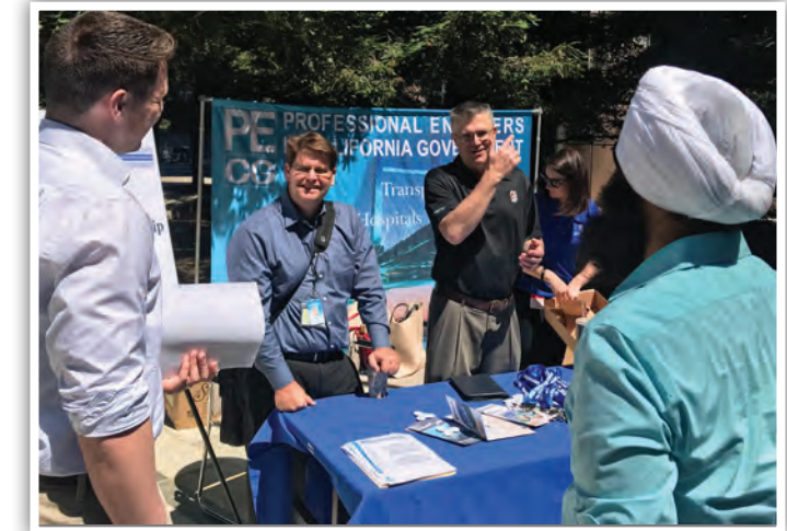
PECG Leaders answer questions and discuss the benefits of membership at the CalEPA building

PECG leaders plan to host similar events in the weeks to come. Stay tuned!