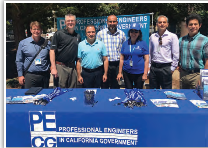
PECG Leaders prepare to recruit new members and reward them with PECG merchandise

Please keep up the good work and keep recruiting new members into PECG!